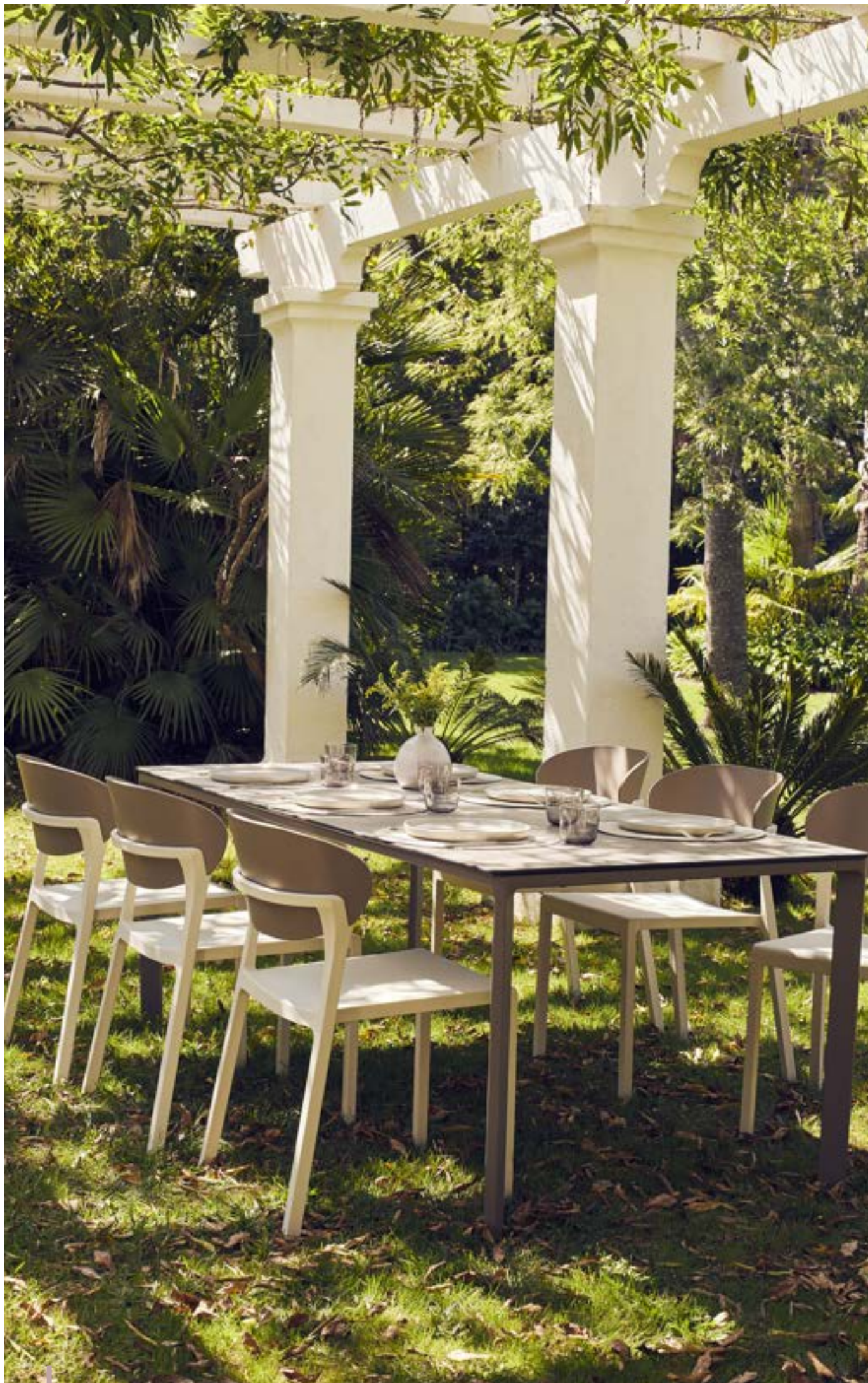
Dining room set