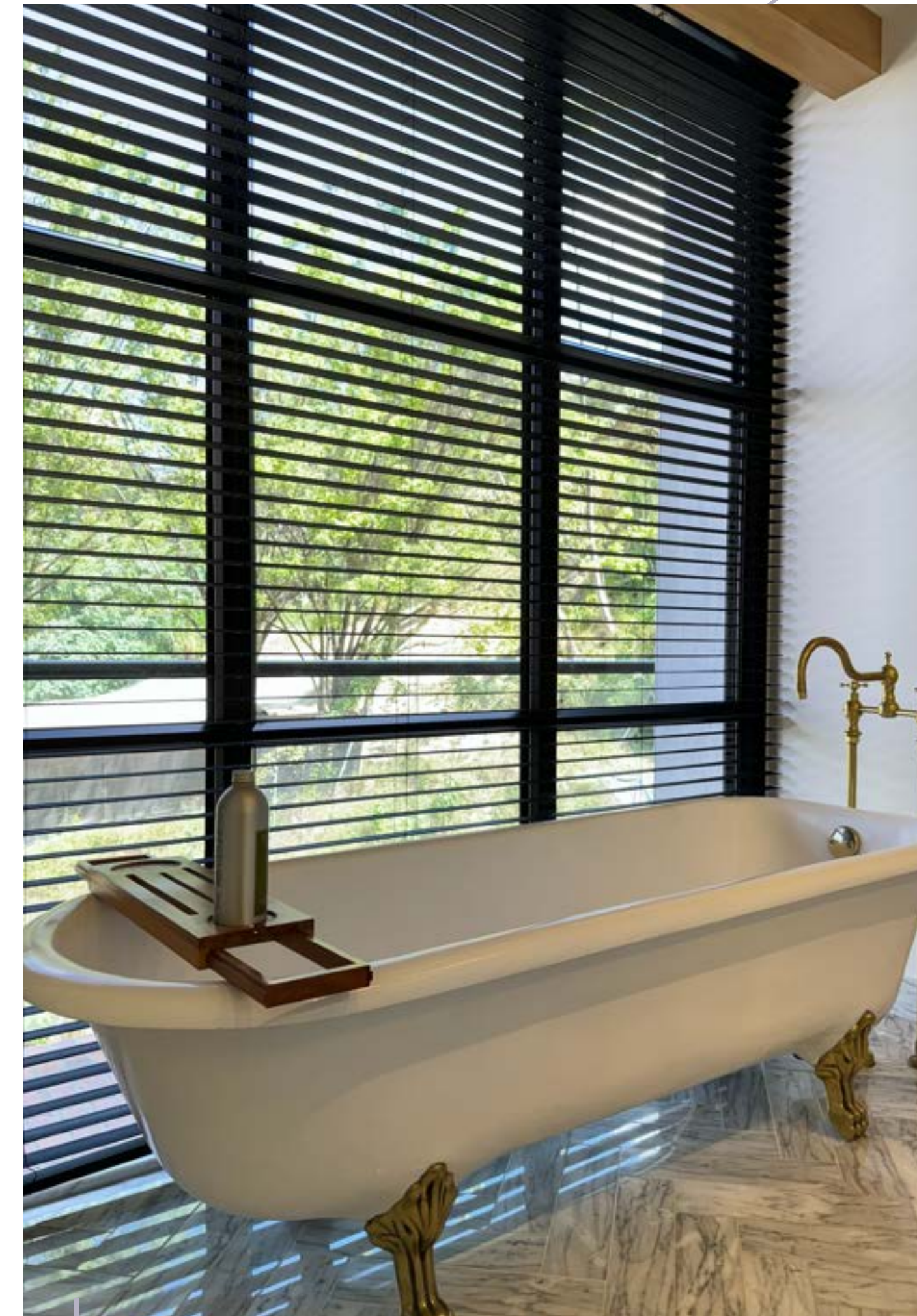
Canvas blinds | Hotel