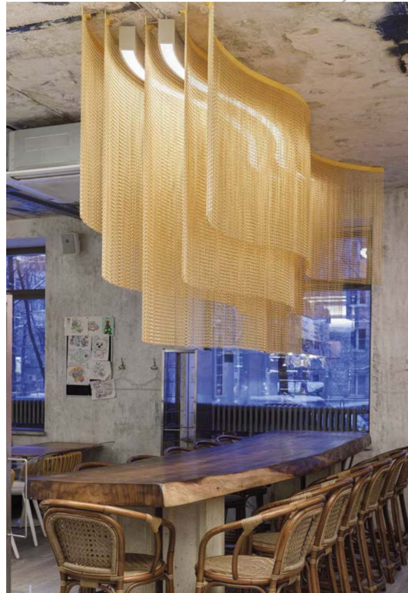
Ceiling feature | Restaurant