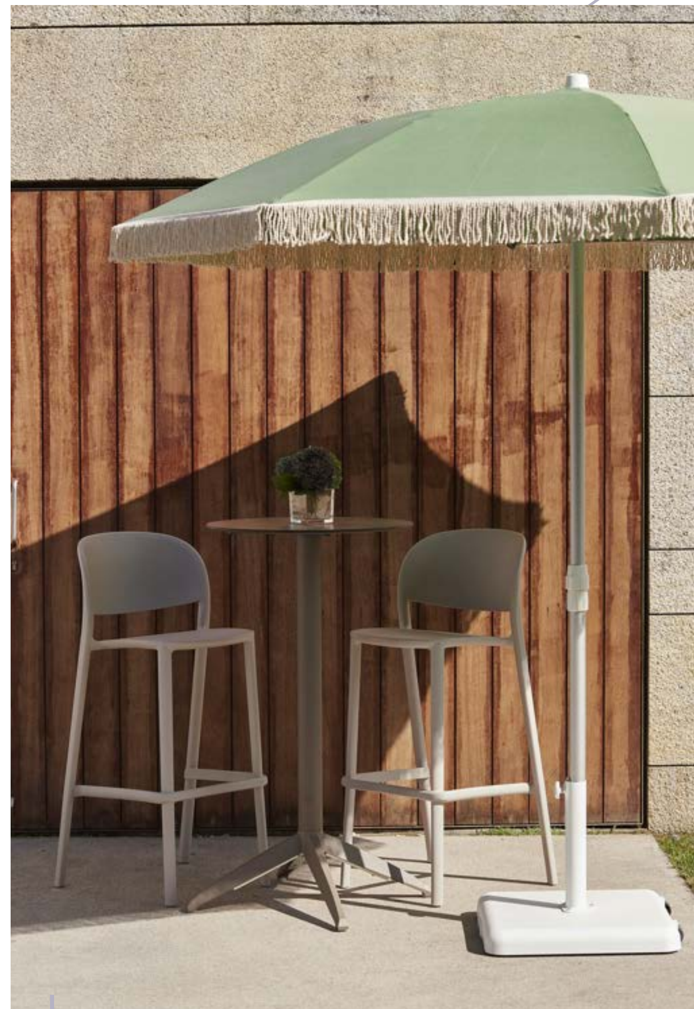
Classic with valance