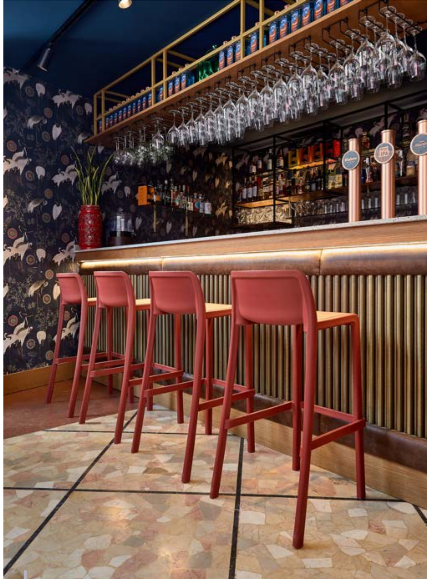
Restaurant Bar stools