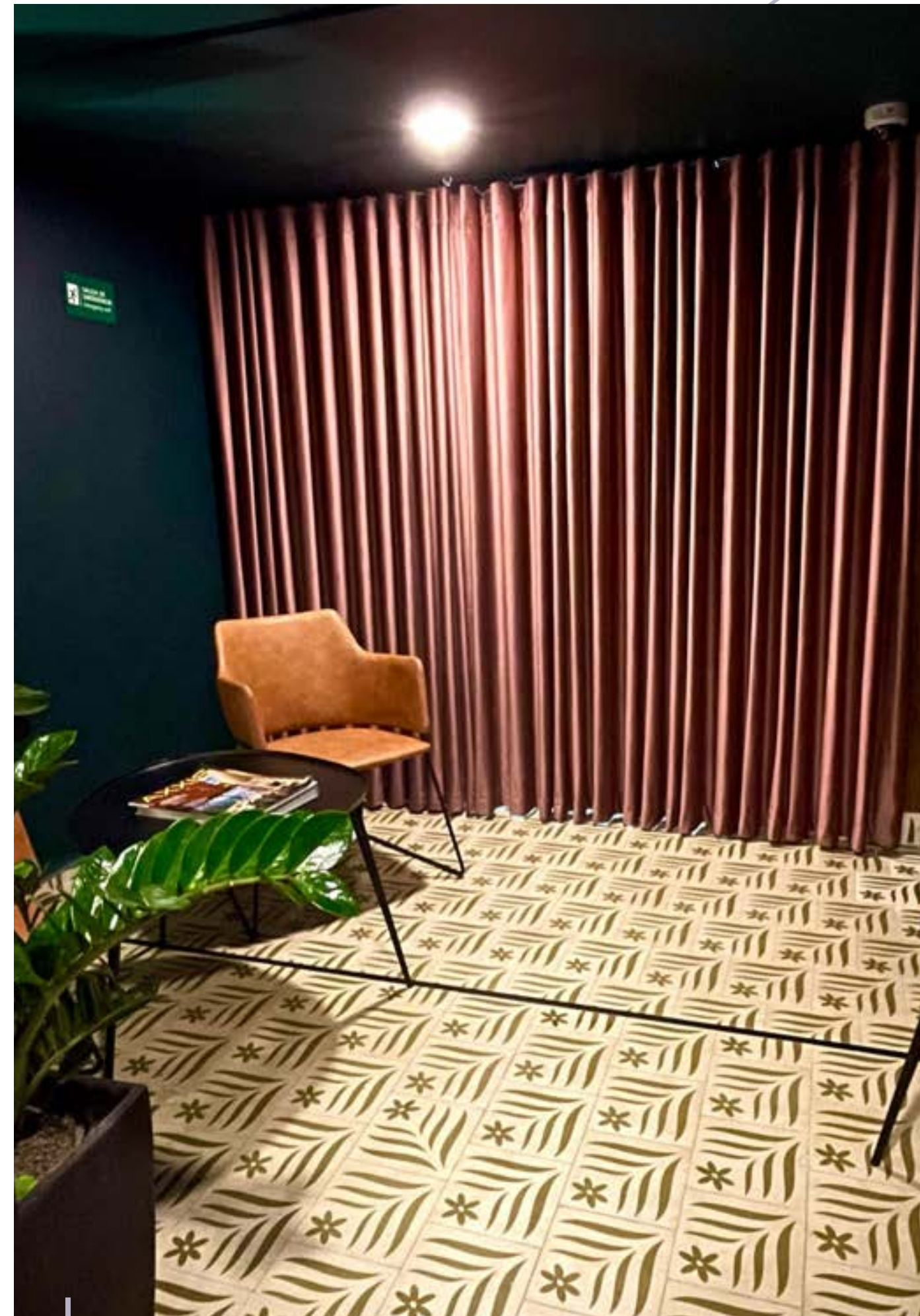
Velvet | hotel lobby