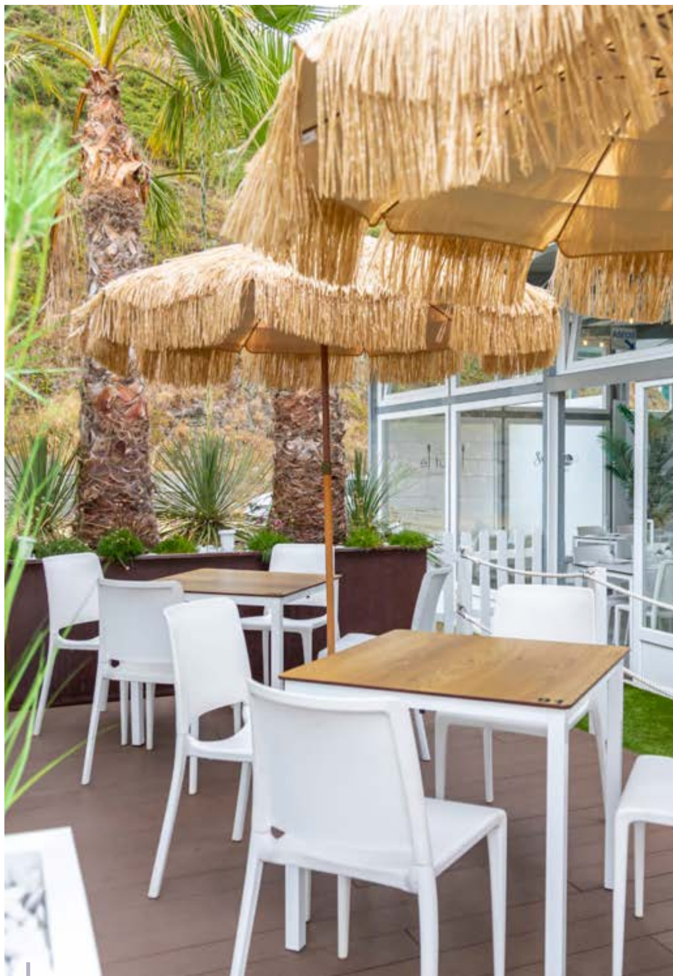
Raffia synthetic fiber