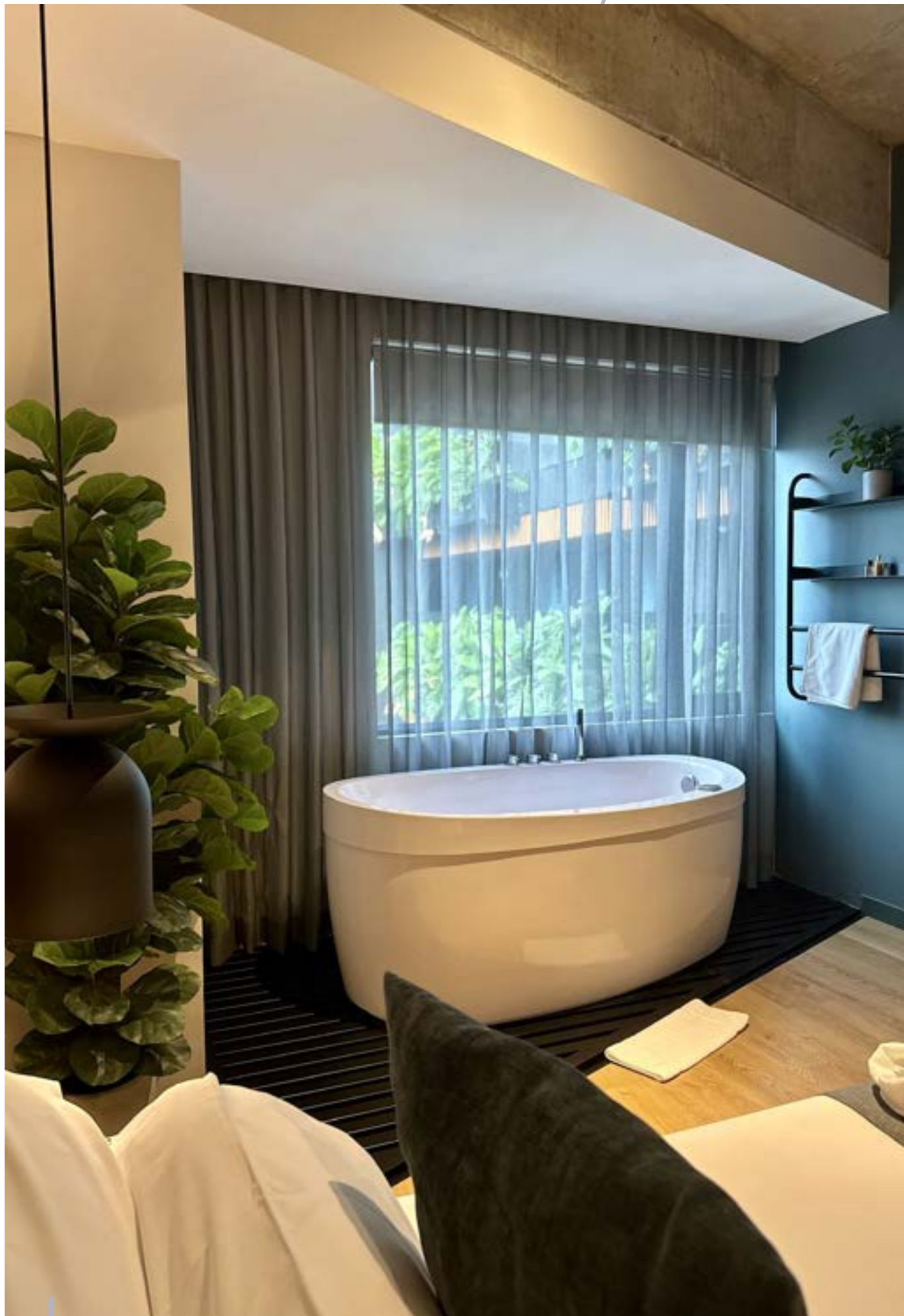
Sheer blackout | hotel