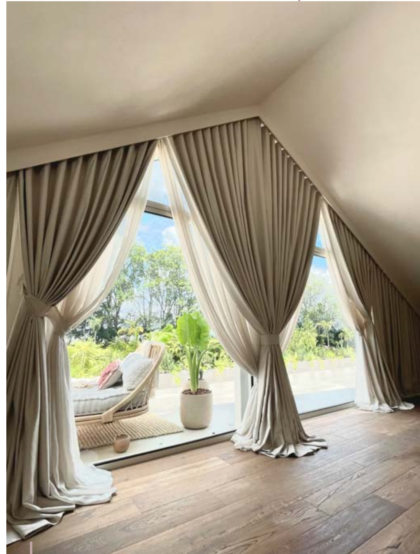
Sheer & blackout