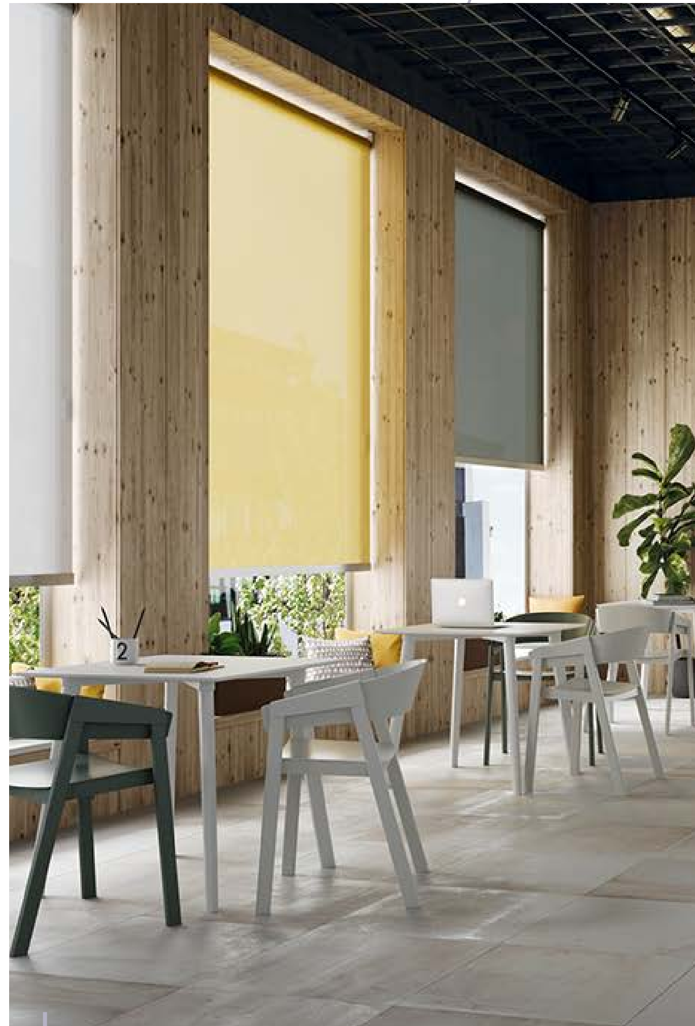
Roller shades | Restaurant