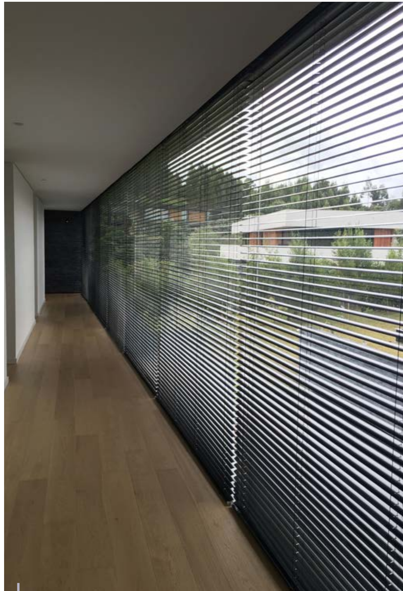
Aluminum blinds | Office