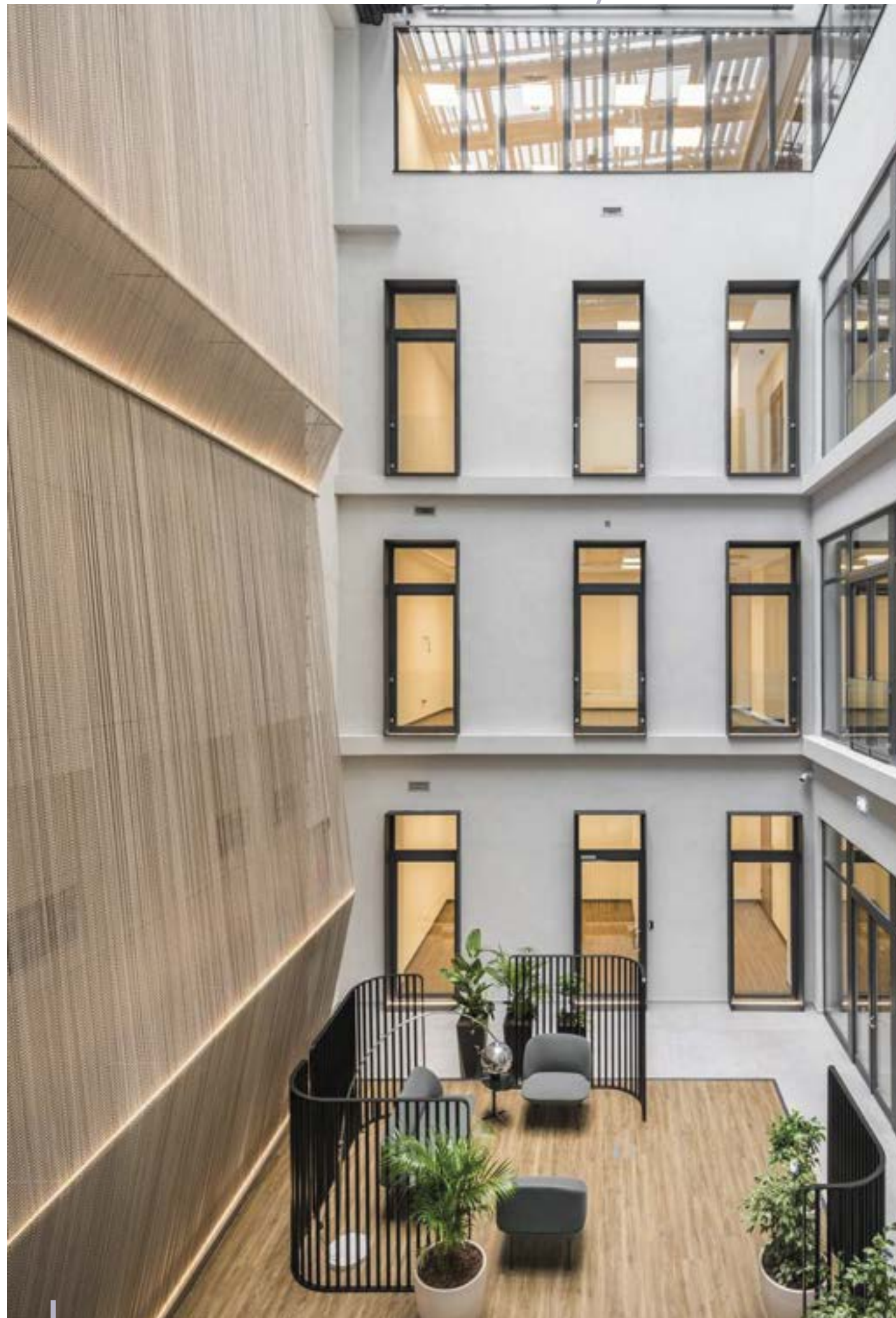
Wallcovering | Hotel