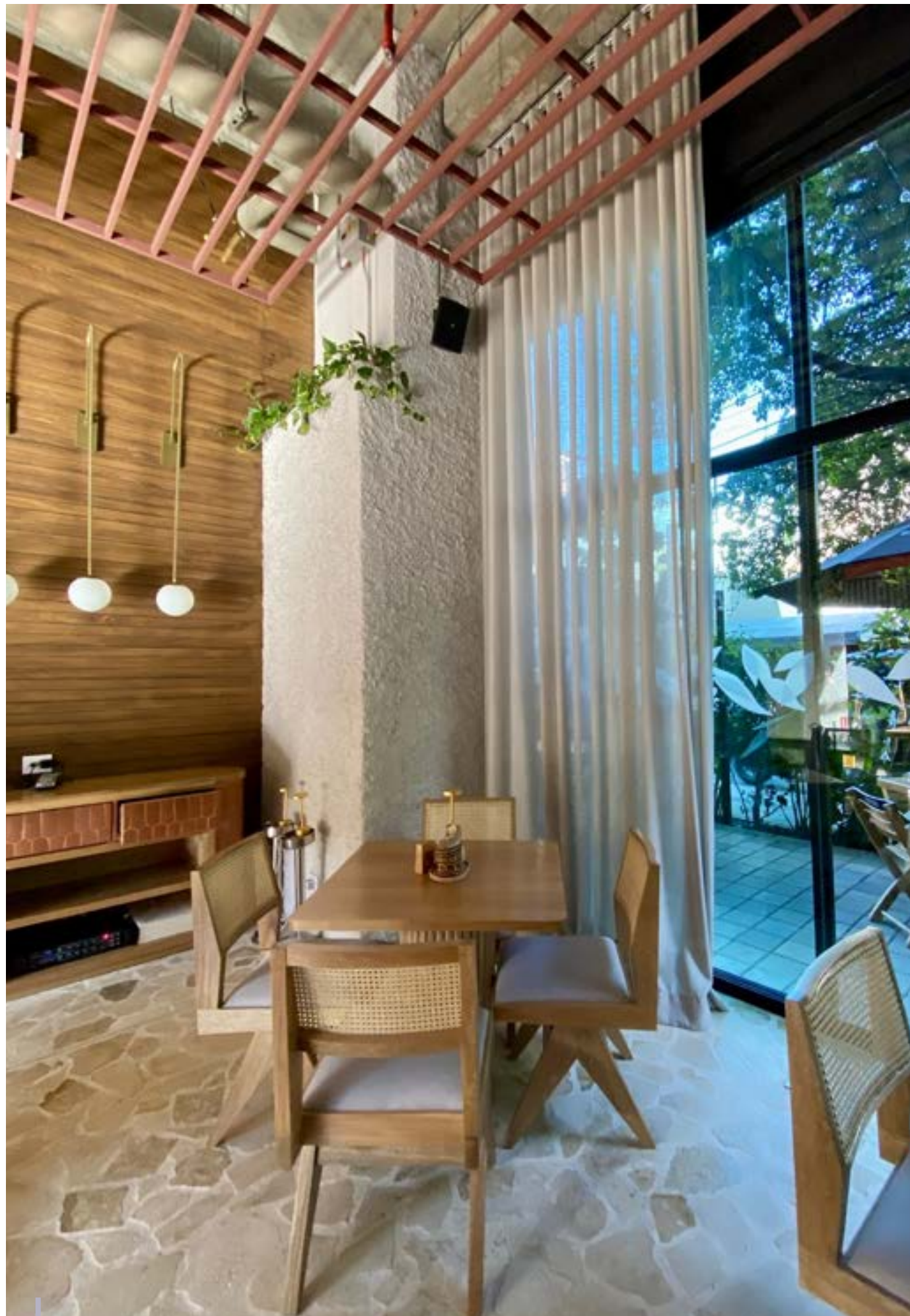
Sheer | Restaurant