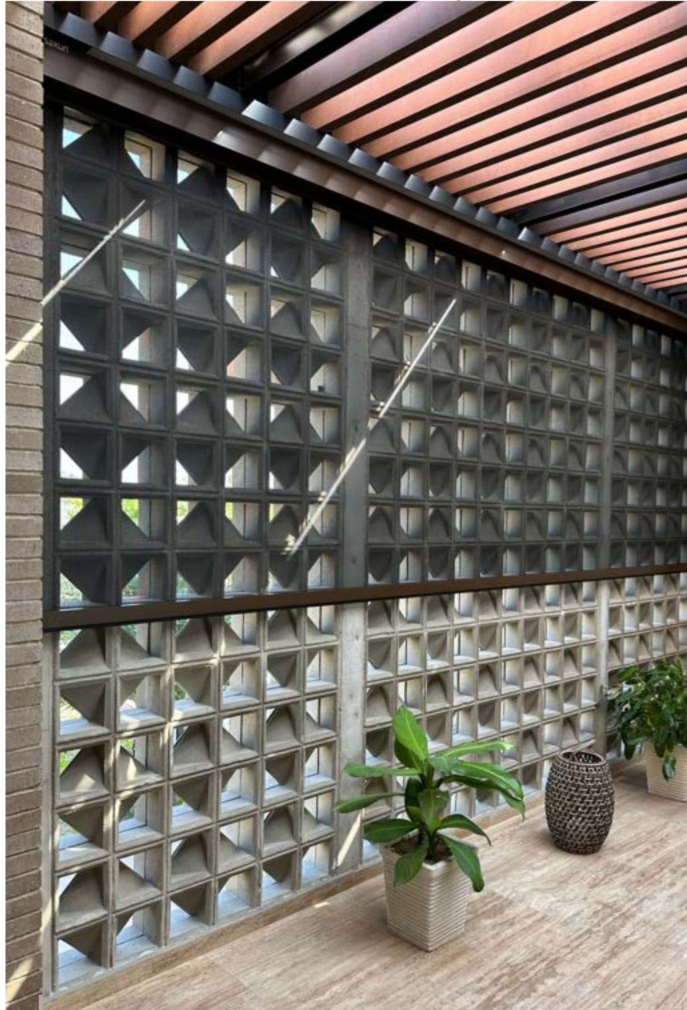
Wind screen (Mosquito net)